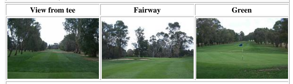
Sponsor – hole 12

A tight tee shot through a narrow chute of trees. Driving onto the fairway will be rewarded with a short pitch to a receptive green. The green has a slight back to front slope.